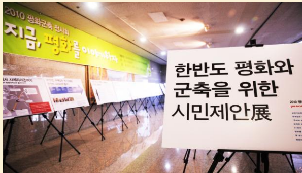
Peace & Disarmament Exhibition in the Korean National Assembly lobby – the sign on the right announces a civil society proposal for peace and disarmament on the Korean peninsula.

On November 18, 2010, peace activists from Japan, South Korea, China, the United States, and Europe converged on Seoul for a conference, a strategy session, and lobbying in the Korean National Assembly. The purpose was to build support for reducing military spending in the region and to promote a regional nuclear-weapons-free zone.