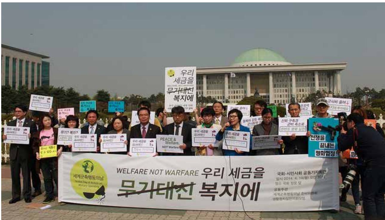
‘Welfare not Warfare’ protest at the South Korean Parliament, Seoul – Global Day of Action on Military Spending, April 2014.