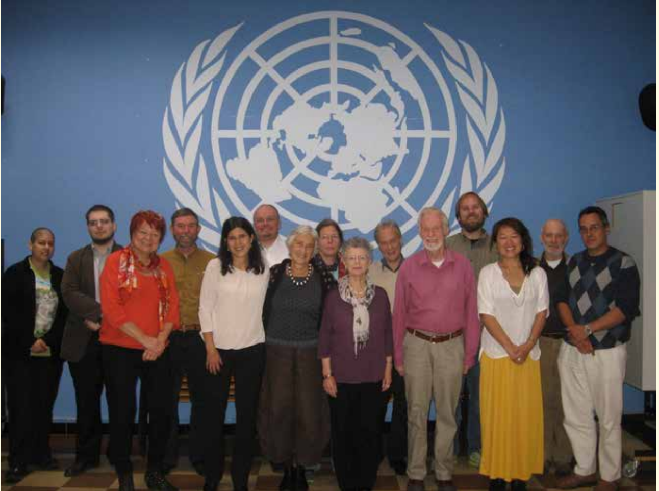
The Council meeting at Ghent, October 2014.